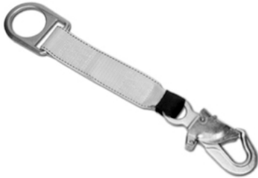
880040 : D-Ring Extender with snap hook 17" (43cm)