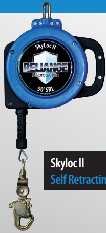
Skyloc II Self Retracting Lifeline