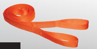
Tag Line Neon Orange Nylon