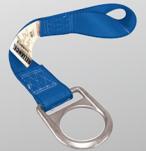
880041 D-Ring Extender