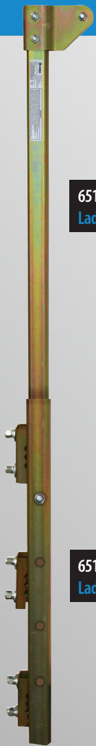
6515-1 Ladder Stanchion Davit