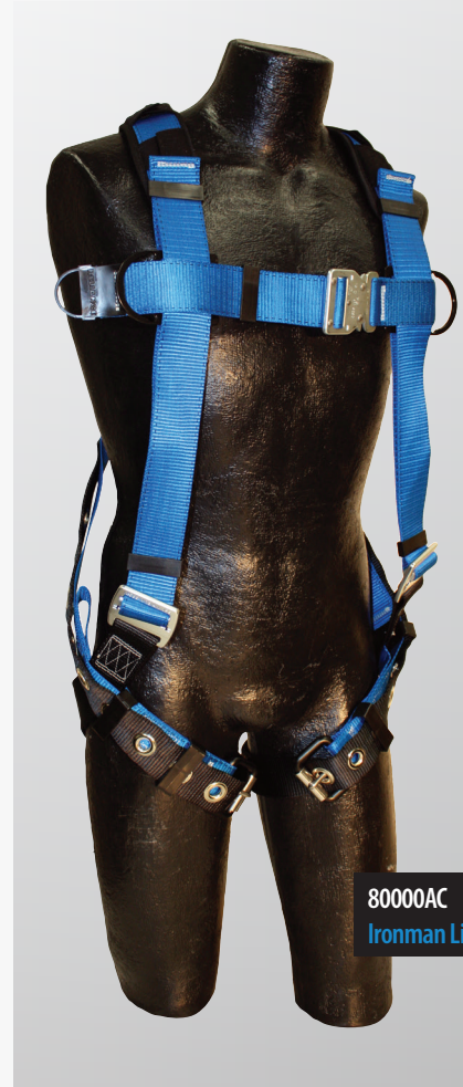
80000AC Ironman Lite Harness