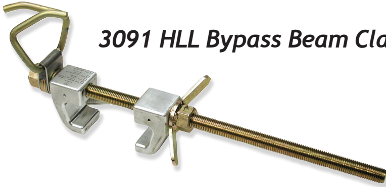
3091 HLL Bypass Beam Clamp

Items listed here are system components that are typically used in Reliance's Structural Steel Horizontal Lifeline Systems. Please note that these items may not be sold individually, only as part of a system. Contact Reliance for more details.