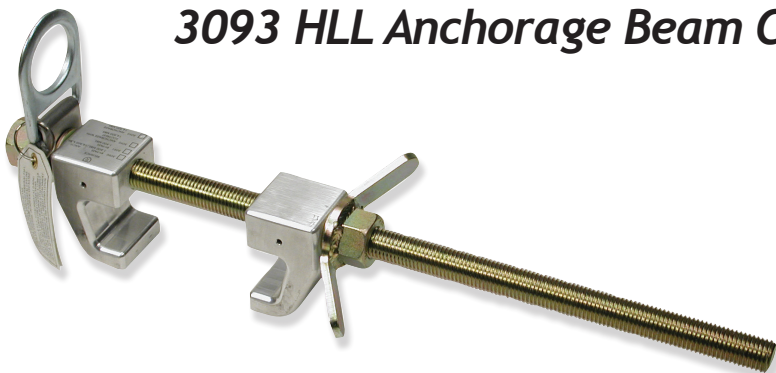
3093 HLL Anchorage Beam Clamp