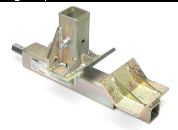
6235 HLL Stanchion Beam Clamp (Inverted)