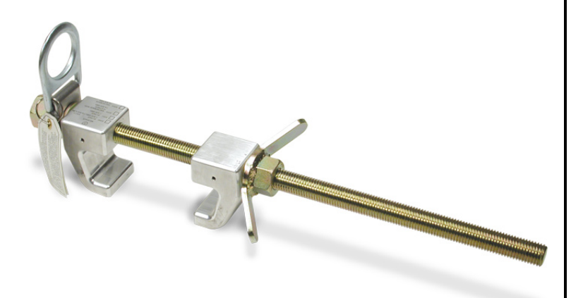
3093 HLL Anchor Clamp