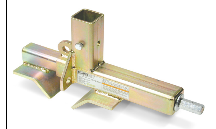
6240 HLL Stanchion Beam Clamp (Universal)