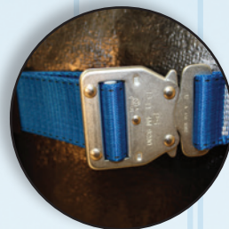
Slim Profile Quick Connect Chest Buckle