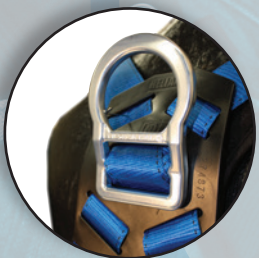
Stand-Up Aluminum Dorsal D-Ring