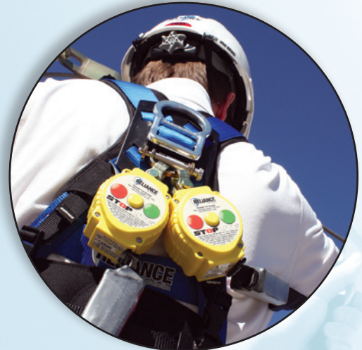
Ideal for use with the Reliance StopLite®