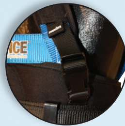
Back Belt Position Adjustors