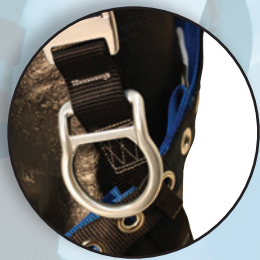
Aluminum Positioning D-Rings (802000)