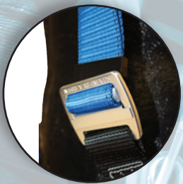
Aluminum Torso Adjustors