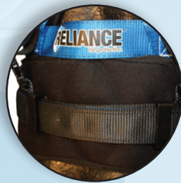
Integrated Back Belt (812000)