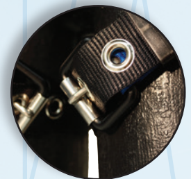
Silver Aluminum Grommets