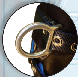
Aluminum Positioning D-Rings (812000)